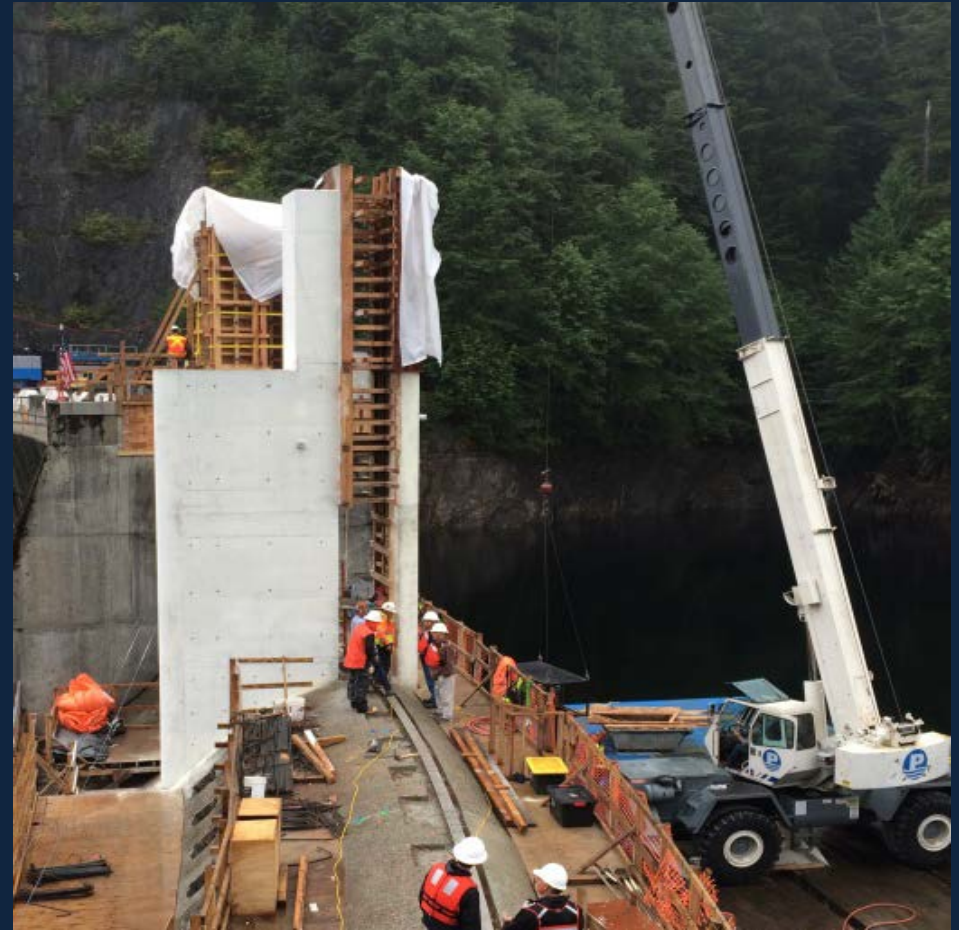
August 10 2016