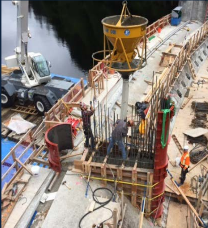
July 7 2016